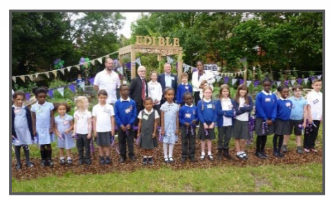
5 schools now have Edible Playgrounds

7 Food Flagship schools have supported staff from 48 other local schools to make improvements to their food provision and education